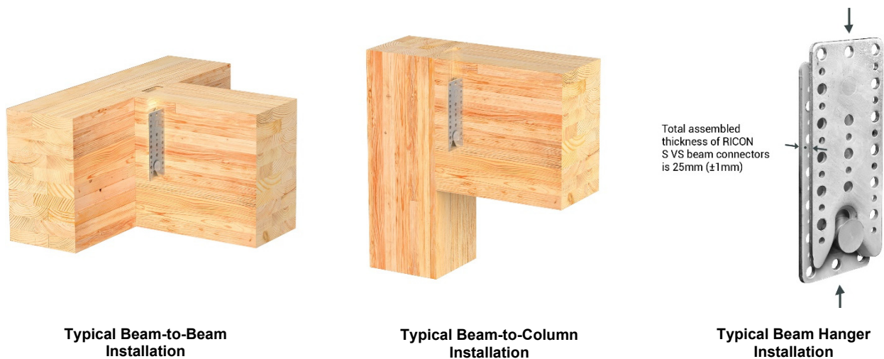
Typical Beam-to-Beam Installation