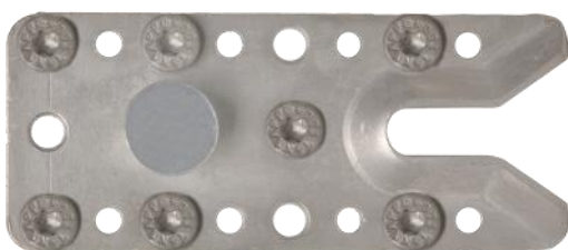
Ricon S VS 140/60

This is considered Phase 1 of this test campaign, which will lead to Phase 2 which will focus on determining the capacity and design values of various Ricon® S VS pre-engineered connectors in D.Fir-L Glulam. Specifically, this phase will also focus on the influence that varying the moisture content of the timber host may have on the shear capacity of these connection systems. This will be achieved by elevating the moisture content of the timber member, after the connect has been installed, to 24%. Following this, subsequent drying will follow prior to testing.